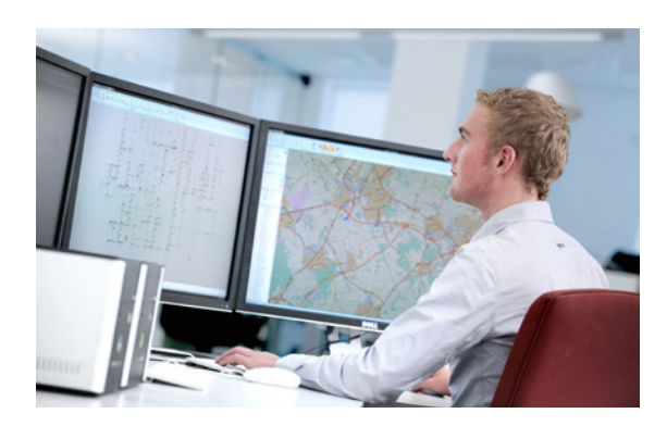
Organised status overview per charging station

In conclusion, ICU EZ helps the Alfen Charging Equipment technical service desk to offer support remotely. The technical service desk can remotely identify and solve occurred incidents. This could save significant administration and maintenance costs of the charging station.